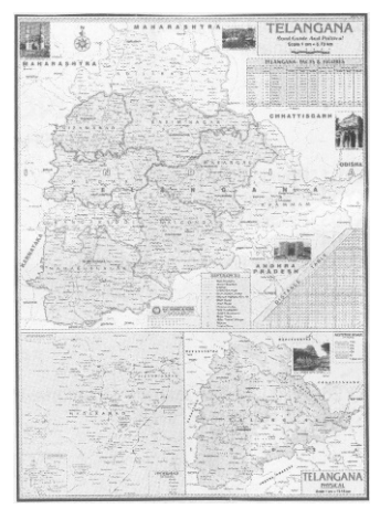
BGM-23 Geography Charts—Designed by experts in a scientific way, Size 70×100 cm., laminated in English and Hindi combined.